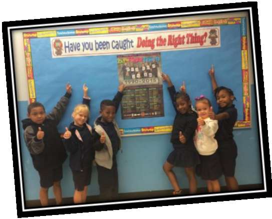
Values Matter at Madie Ives Elementary School!