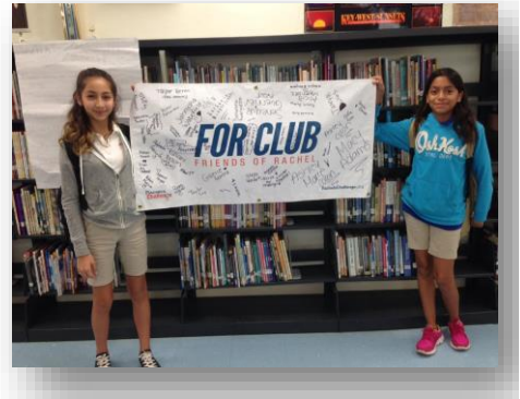
Friends of Rachel (FOR) Club spreading kindness at Redland Middle School.

Grades 9-12: Many experts claim that kindness is more important to success than intelligence or talent. Based on your personal experience, do you agree or disagree? Cite specific details to support your answer.