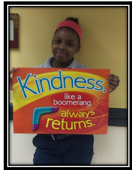
Kindness matters at Horace Mann Middle School.

TOP SECRET KINDNESS MISSION. Each child in the class will receive a manila envelope with their name across the top along with the words TOP SECRET in bright red letters. Inside, each student will receive their mission! Each child who chooses to accept the mission will be required to do a random act of service or kindness for another person for seven days, but there's the catch! They can't let the person know that they are working on a mission – they must just do the kind act out of just that...KINDNESS! Also included in the envelope are ideas that the students could use to complete their mission like secretly clean out their mom or dad's car or write a nice note to someone telling them how much they are appreciated.